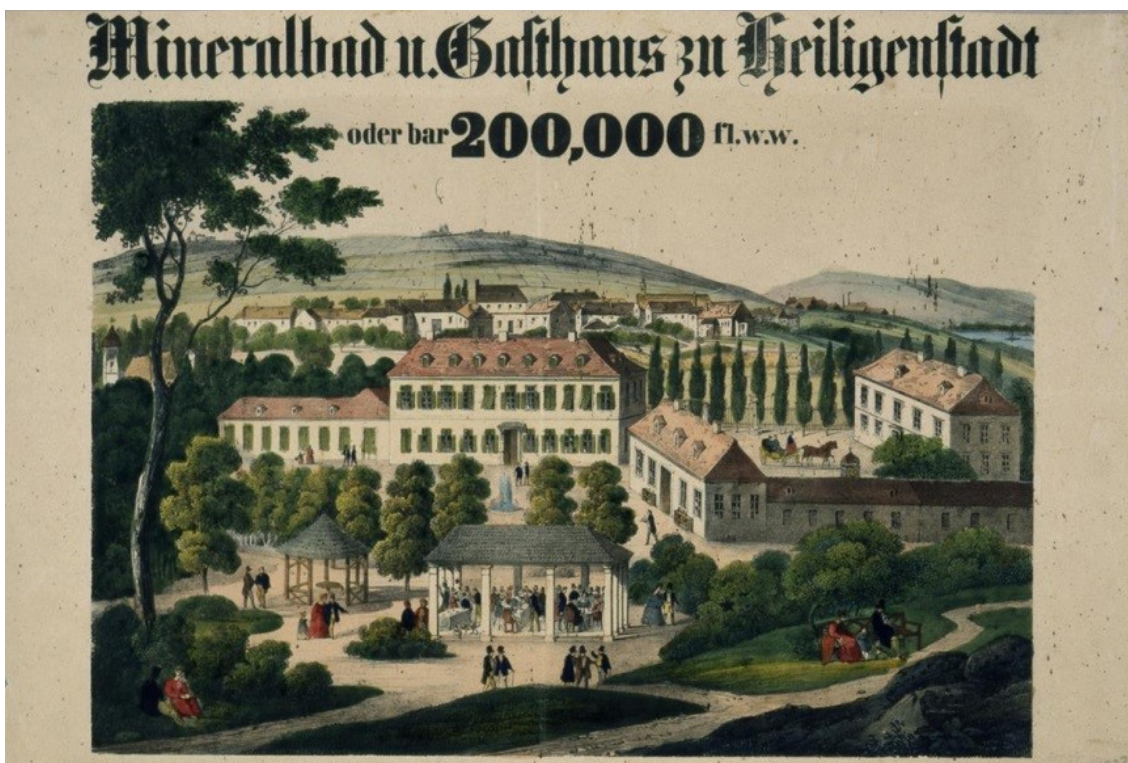
Figure 1. A postcard showing the tourist nature of Heilingenstadt.

The name Heilingenstadt means "holy city" suggesting that this was a place of religious worship already in pre-Christian times. In medieval times, the area was rich, the inhabitants lived from agriculture, fishing on the western branch of the Danube and from the production of wine: the nearby and important Klosterneuburg Monastery already owned large vineyards around 1250. Economic crisis occurred after the "second siege of Vienna" in 1683. During this great clash with the Ottoman army, many of local inhabitants were massacred. The economy gradually recovered during the 18th century as local livestock and fruit became popular in Vienna's markets. The recovery was also favored towards the end of the 1700s by the construction of a SPA, which exploited a hot water spring. Up to 300 people frequented the place and the adjacent restaurant every day. In the summer months, Heilingenstadt became a popular tourist destination (Figure 1).