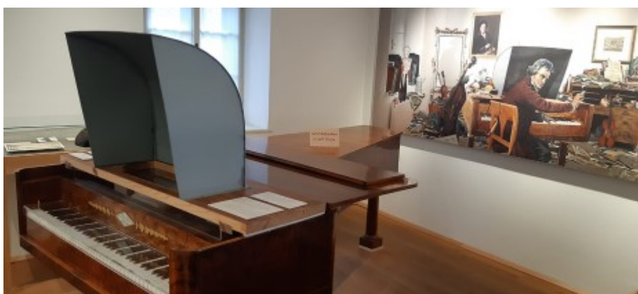
Figure 2. Beethoven's piano with sound amplifier.

The room where Beethoven's piano is shown is touching because the composer, in order to amplify the sound, had placed the metal scaffolding, normally superimposed on the prompter's box on the stage, on it ( Figure 2 ).