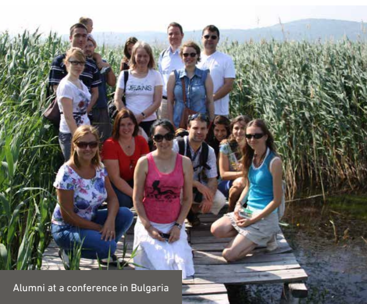
Alumni at a conference in Bulgaria

DBU coaches its fellows during the whole stay. During seminars the fellowship recipients can present their topics and their results and network with each other. Furthermore, DBU welcomes and supports individual initiatives to organize further professional events and seminars.