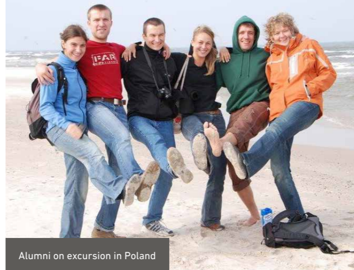
Alumni on excursion in Poland

During the fellowship practical solutions for current environmental issues are developed. After their stay in Germany the alumni are well qualified to tackle these issues in their home countries thus assuring efficient knowledge transfer. Working closely together in an international context helps to breakdown existing barriers. The acquired contacts will create a strong network of highly committed environmental experts.