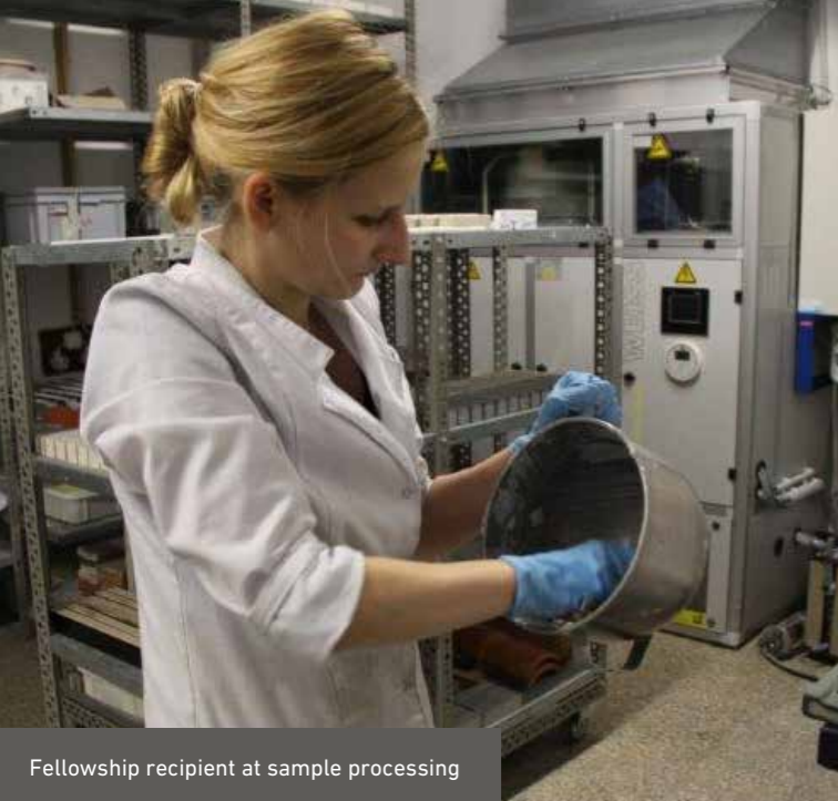
Fellowship recipient at sample processing