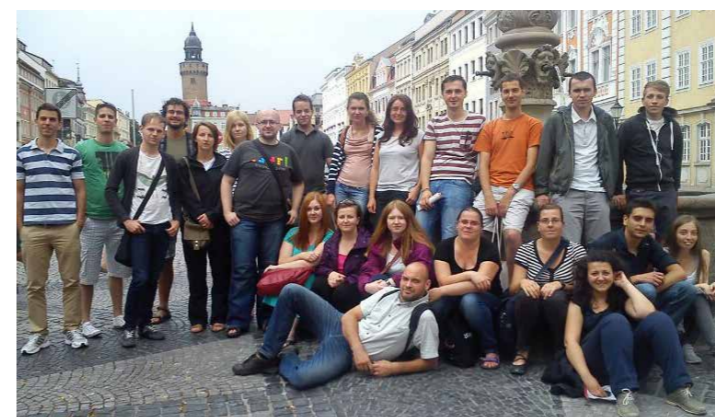
Fellowship recipients during a city tour